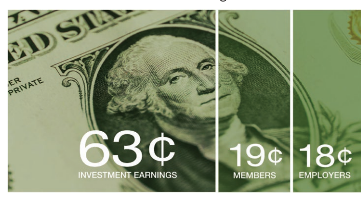
Note: The 19 \, \text{¢} includes member contributions and service purchases.

Your contributions, your employer's contributions and the investment returns PSRS earns by investing those contributions all help fund your secure retirement future.