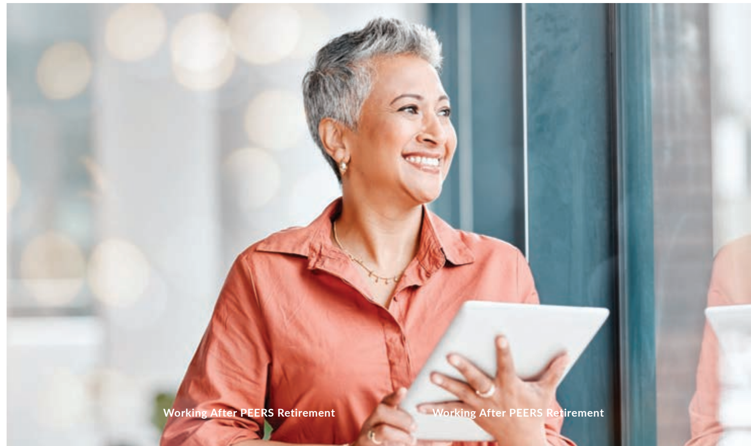
Working After PEERS Retirement

If you substitute teach for a PEERS-covered K-12 school district, a DESE-issued educator certificate or substitute teaching certificate is required in order for your work to be covered under this temporary waiver. For information on how to obtain a substitute teaching certificate, please contact DESE.