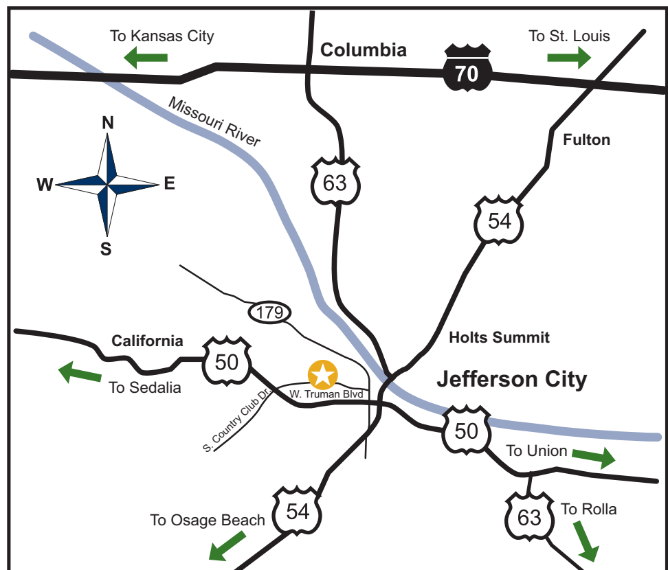
Map to PEERS

You may visit PEERS between 7:30 a.m. and 4:30 p.m. Monday through Friday, except on holidays. Calling ahead allows us to prepare personalized information for your meeting and have it available for you upon your arrival. Our office is located at 3210 West Truman Boulevard in Jefferson City. Please refer to the map for directions.