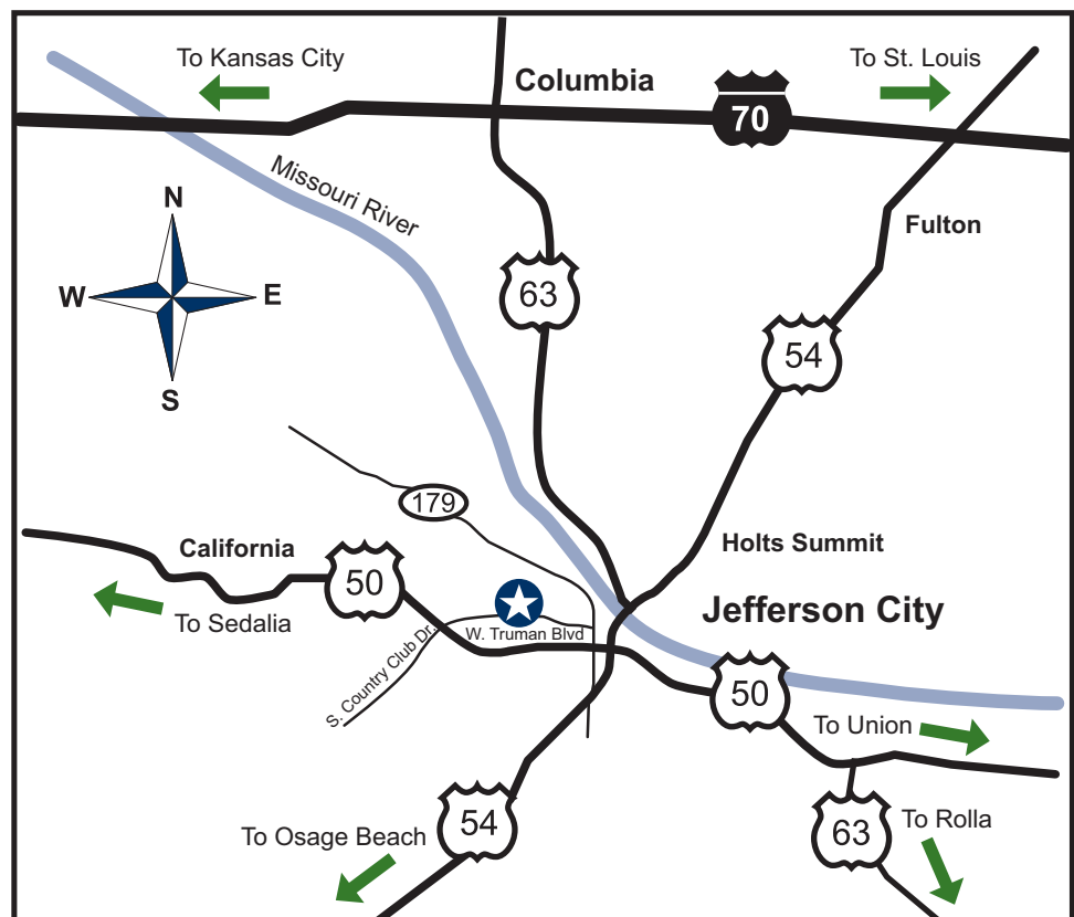
Map to PEERS

You may visit PEERS between 7:30 a.m. and 5 p.m., Monday through Friday, except on holidays. Calling ahead allows us to prepare personalized information for your meeting and have it available for you upon your arrival. Our office is located at 3210 West Truman Boulevard in Jefferson City. Please refer to the map for directions.